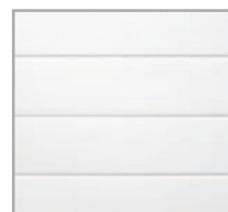
Light Ribbed Panel